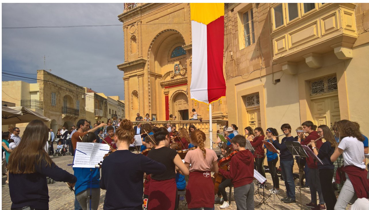
Flash Mob at Marsaxlokk market place, Malta, 2017

I would like to thank all the musicians, their parents, music teachers, and conductors for the wonderful work you have done for the orchestra during the past decades. The objective to give students an opportunity to make music of a high standard in a genuine orchestra setting have been met! “ Kari Kivinen (former headmaster of EEB1)