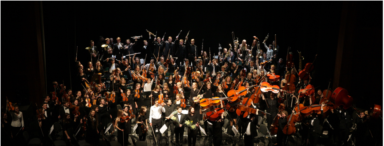
Three students' orchestras at Alytus/Lithuania in 2015