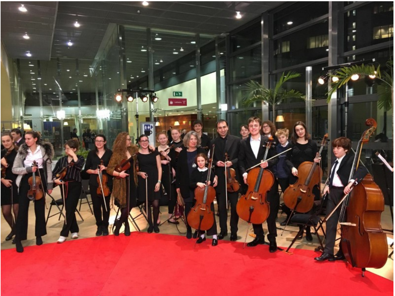
News Year Reception of EU Presiden Jean-Claude Juncker at the Berlayment, 17.01.2018, chamber orchestra