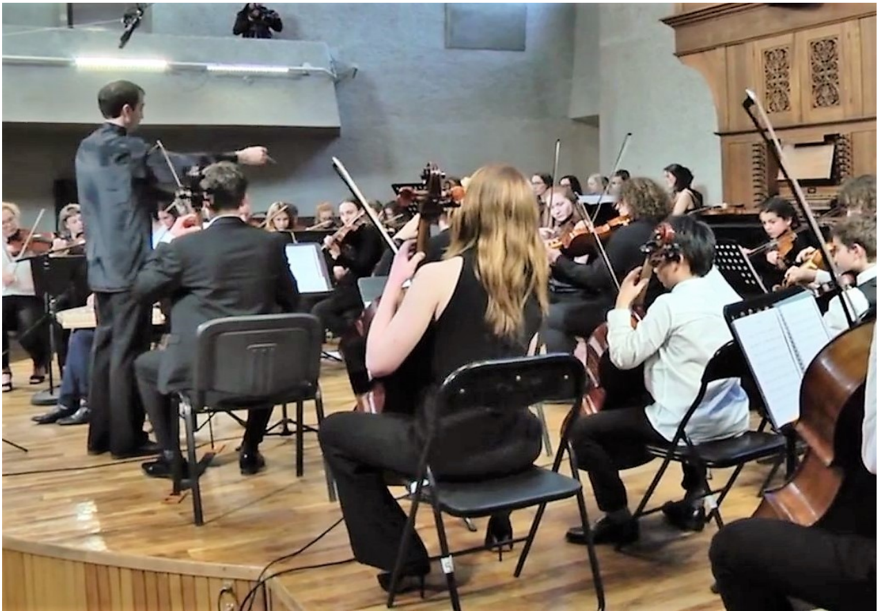
Concert organized from the EU-delegation in Yerevan, Armenia 2018, younger and older students play side by side