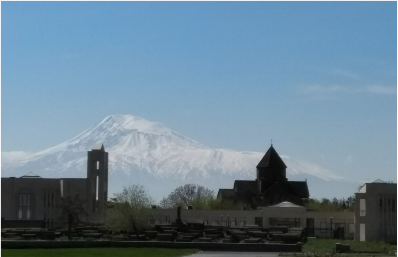
Mount Ararat behind the monastery in Echmiadzin, Armenia 2018